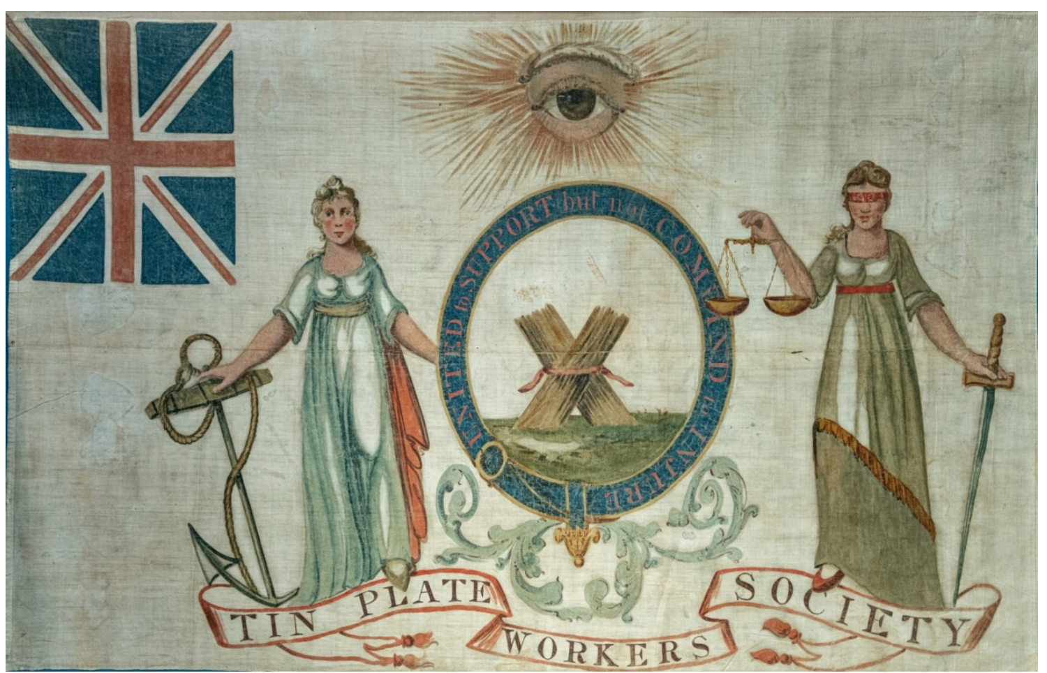
Tin Plate Workers Society banner, 1821, on display in Main Gallery One at People's History Museum.

Here are some examples of the historic style that still influences banner design today.