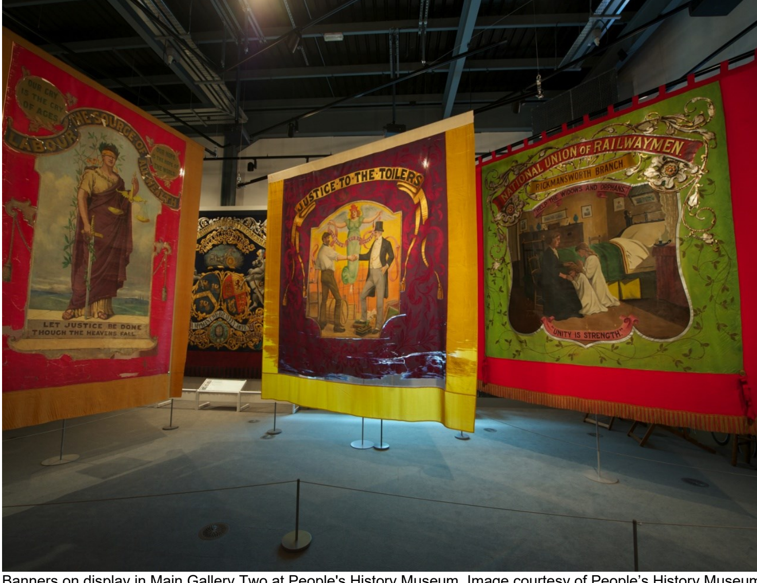
Banners on display in Main Gallery Two at People's History Museum.