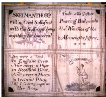
Flag, H178cm x W198cm