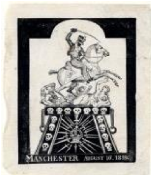
Wood cut print, for use as large scale reproduction