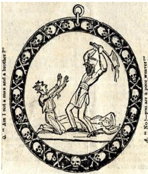
Wood cut print, for use as large scale reproduction