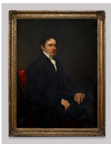
Painting, frame H146cm x W120cm