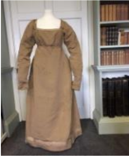
Dress, fawn corded silk, H160-170cm x W85cm x D80cm