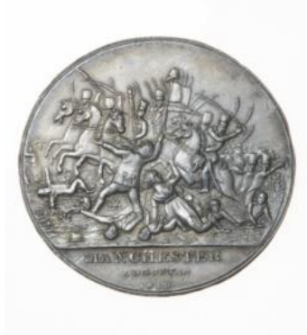
Medal, 8cm x 6cm (approx)