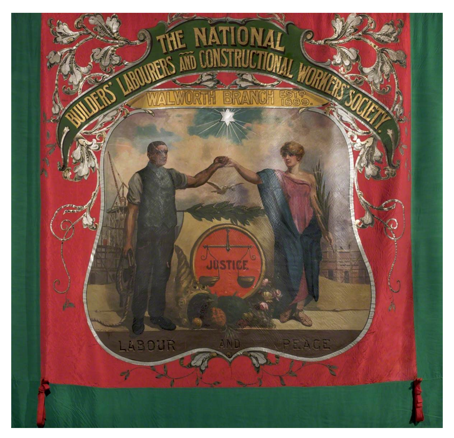
National Builders', labourers and Construction workers society banner © People's History Museum (front and back)