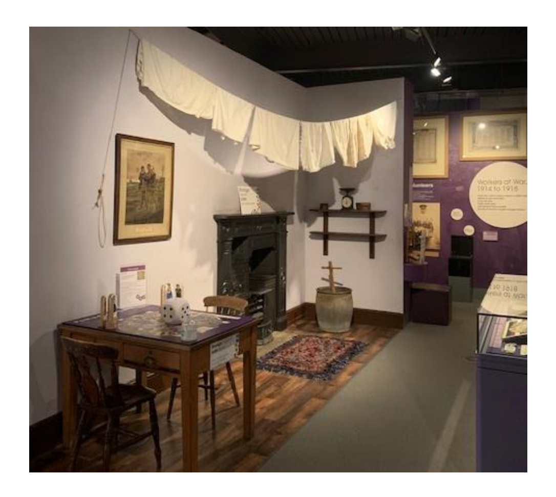
Main Gallery One