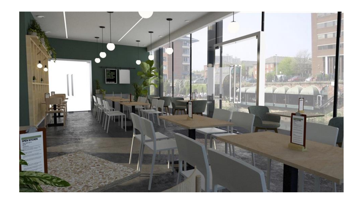
There is a cafe on the ground floor