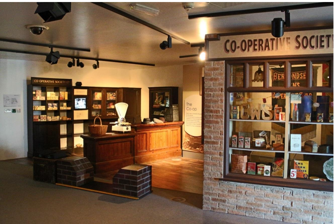
Main Gallery Two