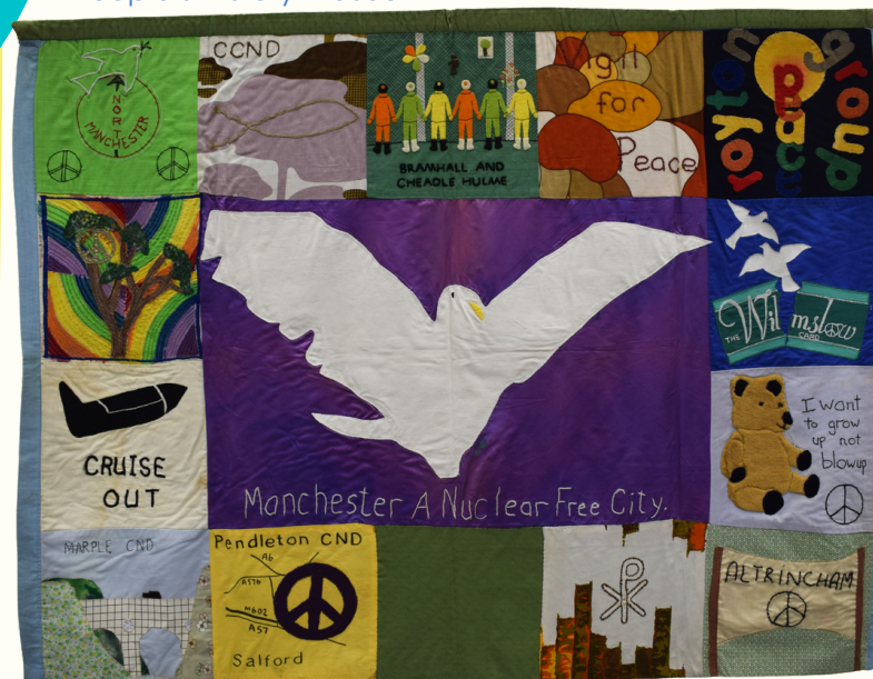
Greater Manchester Campaign for Nuclear Disarmament (CND) banner, 1980s

You can use a banner to show others what is important to you or something you are proud of.