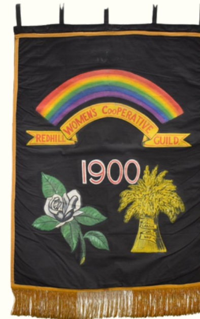
Redhill Women's Cooperative Guild banner, 1900 @ People's History Museum