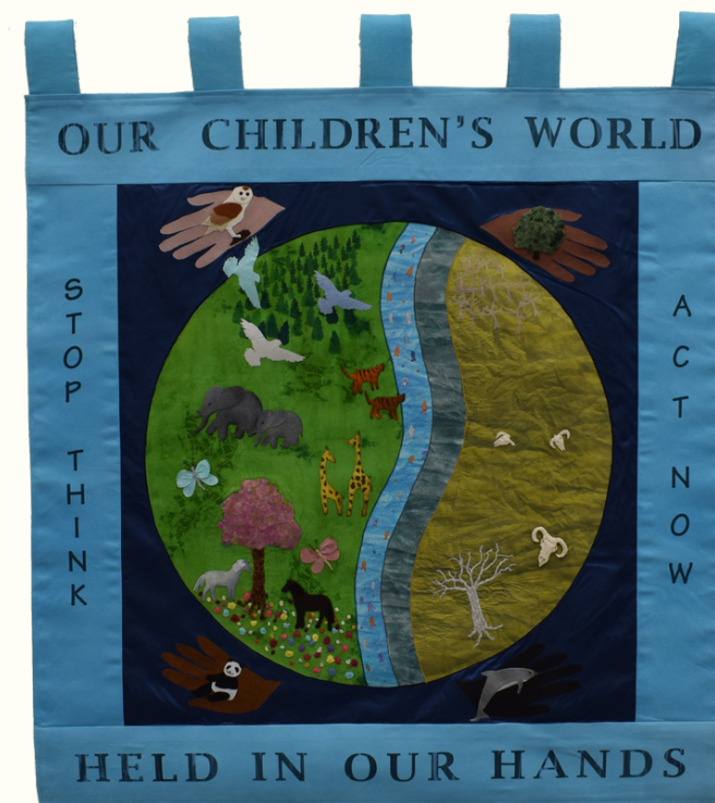
Our Children's World Held in Our Hands banner, 1996