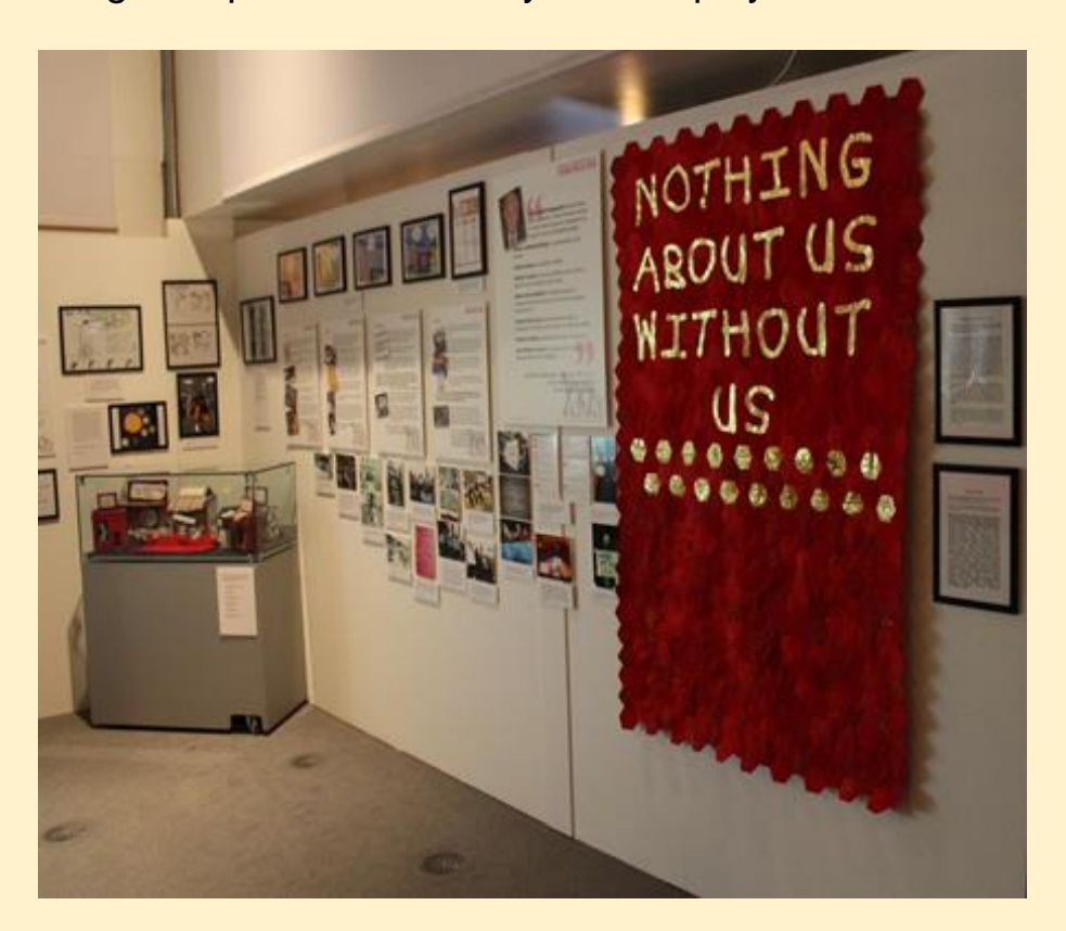
The Disability Discrimination Act, Celebrating 20 Years exhibition, 2015.

Images of past Main Gallery Two displays: