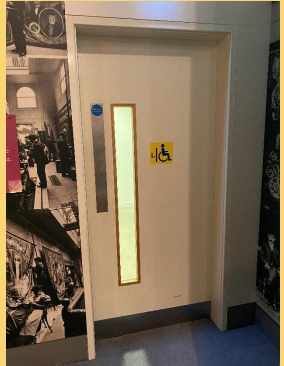
Second floor gender neutral left transfer accessible toilet.