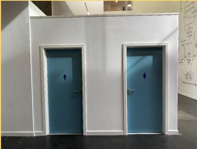
Ground floor gendered toilets.