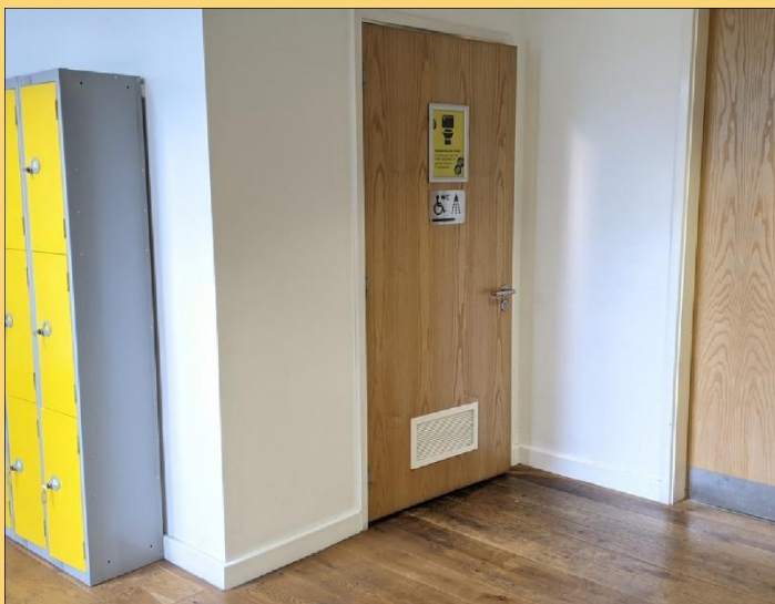
Lower ground floor gender neutral left transfer accessible toilet.

There are gendered toilets on the ground floor.