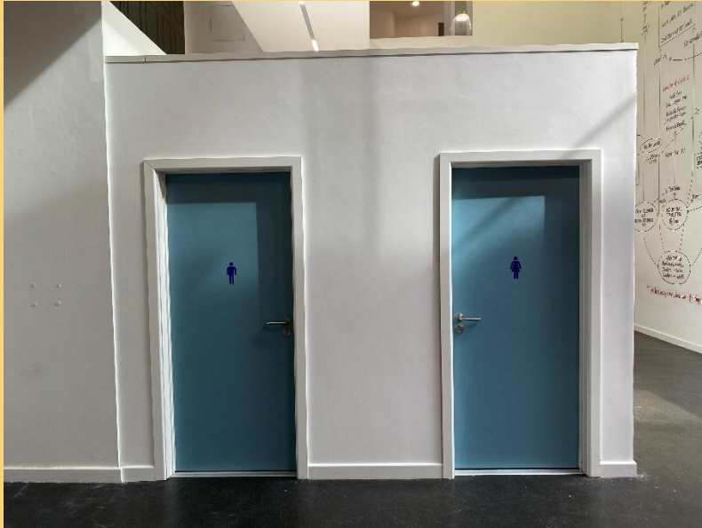
Ground floor gendered toilets.